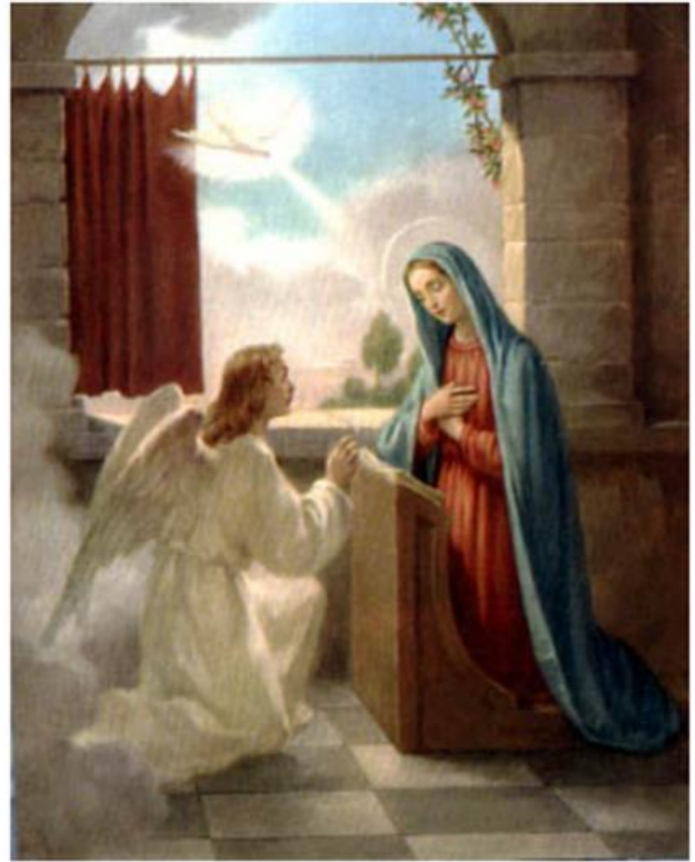
Blessed Virgin Mary