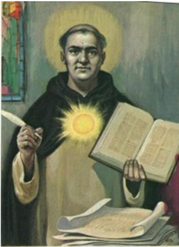
St. Thomas Aquinas