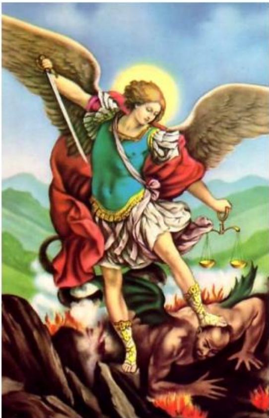
St. Michael the Archangel