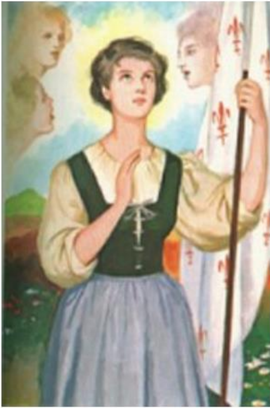
St. Joan of Arc