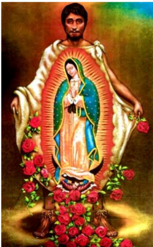
St. Juan Diego