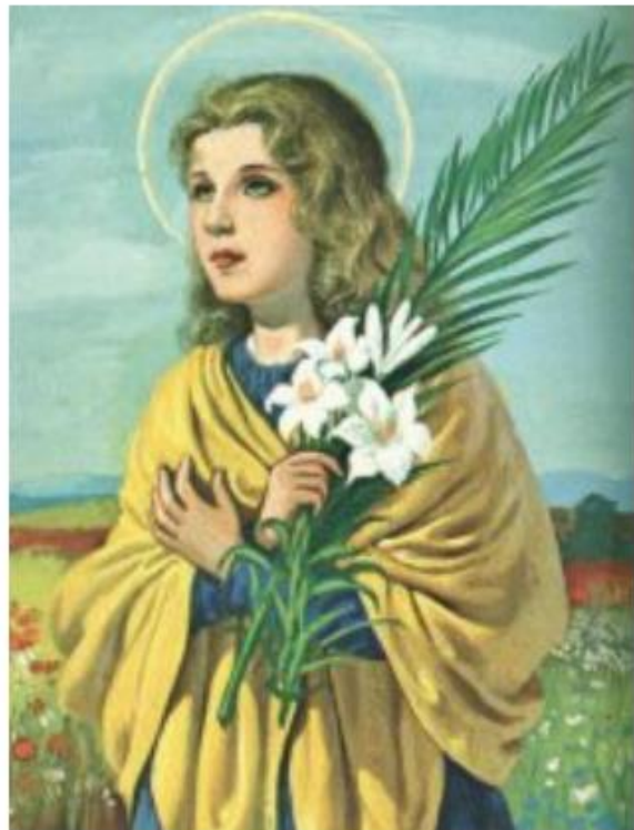
St. Maria Goretti