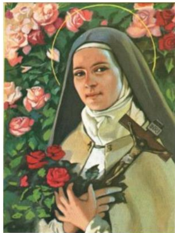
St. Therese of Lisieux