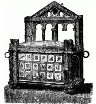
CHAIR OF ST. PETER, ROME.

Today, the Feast of the Chair of St. Peter honors Saint Peter as the one Jesus chose to lead the community after he left the earth. Bishops taught the people as they sat in a special chair or throne called a cathedra (ka-THEE-dra), in their cathedral. The chair became the symbol of the Bishop's office, and Saint Peter was the leader of all the Church, just as our Pope is today.