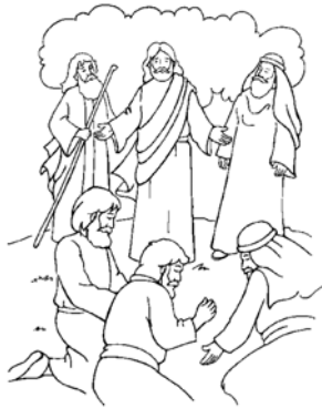
The Mount of Transfiguration Mark 9:2-9

Jesus took with him Peter and John and James, and went up on the mountain to pray. And while he was praying, the appearance of his face changed, and his clothes became dazzling white. Suddenly they saw two men, Moses and Elijah, talking to him. They appeared in glory and were speaking of his departure, which he was about to accomplish at Jerusalem. Just as they were leaving him, Peter said to Jesus, "Master, it is good for us to be here; let us make three dwellings, one for you, one for Moses, and one for Elijah" - not knowing what he said. While he was saying this, a cloud came and overshadowed them; and they were terrified as they entered the cloud. Then from the cloud came a voice that said, "This is my Son, my Chosen; listen to him!" When the voice had spoken, Jesus was found alone. And they kept silent and in those days told no one any of the things they had seen.