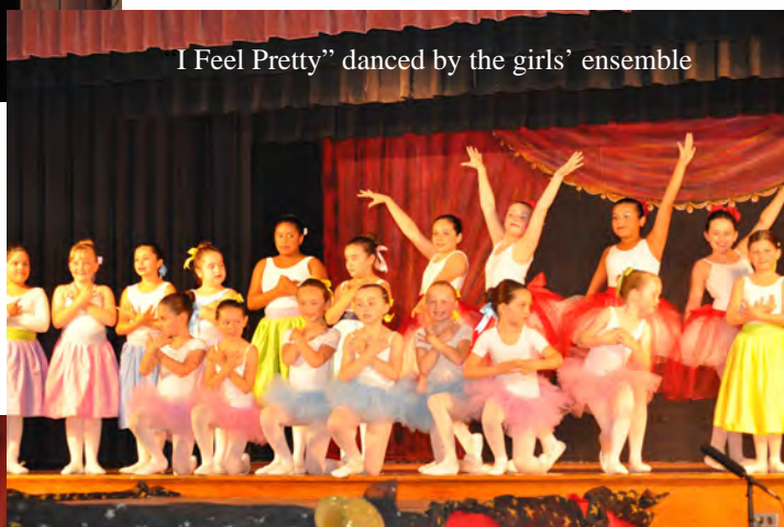
"I Feel Pretty" danced by the girls' ensemble