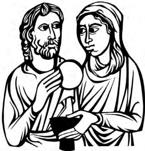
El Cuerpo y la Sangre de Cristo, Año A.