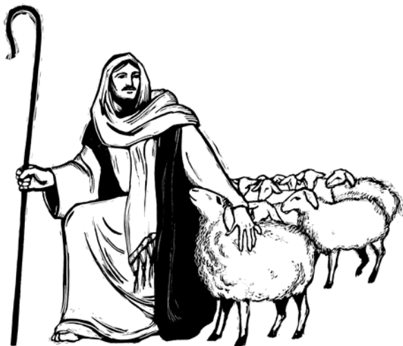
Nuestro Señor Jesucristo, Rey del Universo, Año A.