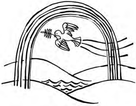
Domingo de Cuaresma, Año B.