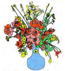
Flowers This Week