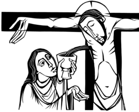
.El Cuerpo y la Sangre de Cristo, Año B. Ilustración © 2008 M. Erspamer. Printed from www.Liturgy.com