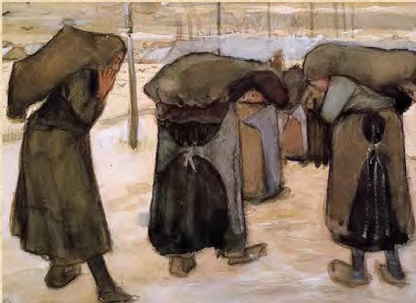
Van Gogh, Women Miners Carrying Coal

THEY TIE UP HEAVY BURDENS HARD TO CARRY AND LAY THEM ON PEOPLE'S SHOULDERS, BUT THEY WILL NOT LIFT A FINGER TO MOVE THEM.